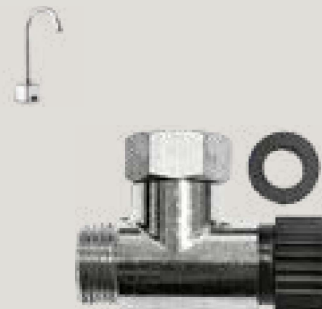
FV-001 Valve for WM-08-AF