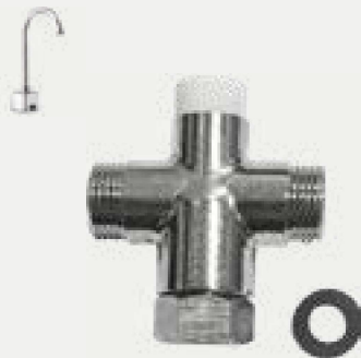
GR100 Mixing valve for WM-08-AF