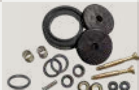
98-HTF Spray valve repair kit 98-R O-ring for Spray Valve