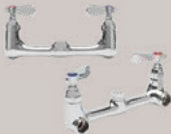
8" Wall mount Pantry Faucet Body 9814-F Female inlets 9814-M Male inlets