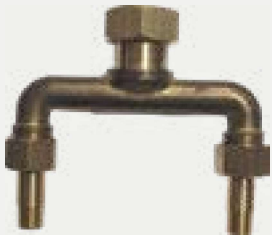
9803 8" Deck Mount Brass Inlet Faucet