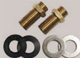
0098-10 Nipple for DM faucet

Plumbing parts are available at all times at our distribution centre located in Dorval.