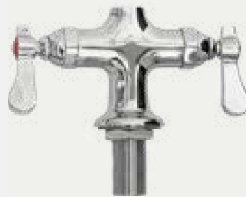
Deck Mount Faucet Body 9816-F Female thread 9816-M Male thread