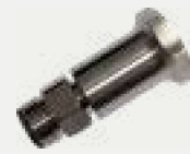
00821-40 Hose Connector