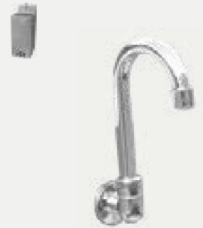
SSDV Pedestal Sink Nozzle for TPS-1617