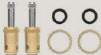
98-V-H Hot Cartridge 98-V-C Cold Cartridge