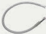
98-H-44 44" flexible hose 98-H-55 55" flexible hose 98-H-68 68" flexible hose