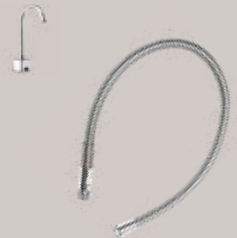
HS420 Hose for WM-08-AF