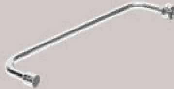
006S 6" Nozzle 008S 8" Nozzle 012S 12" Nozzle