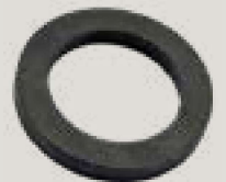
TKS-VALVE TKS-1 Valve