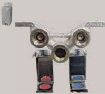
SSDFV Stainless Steel Double Foot Valve for TPS-1617