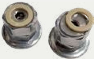
ZZ-00 Connection Fitting