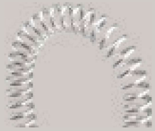
96-SP Coil Spring for hose