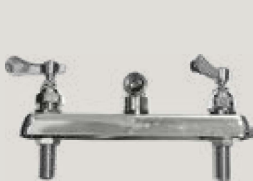
9811 8" Wall Mount Faucet Body