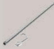
98-PP Riser Pipe (with hook)