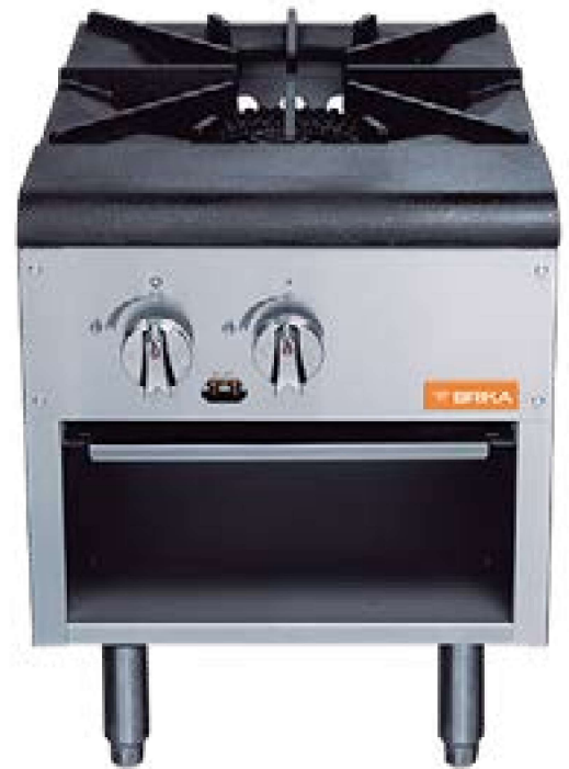
18" STOCK POT